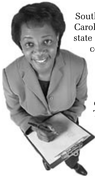
South Carolina's state

As the agency responsible for the investments of the South Carolina Retirement Systems, the Commission believes it has a duty to educate the members of the Retirement Systems, and the overall public, about Amendment 3a .